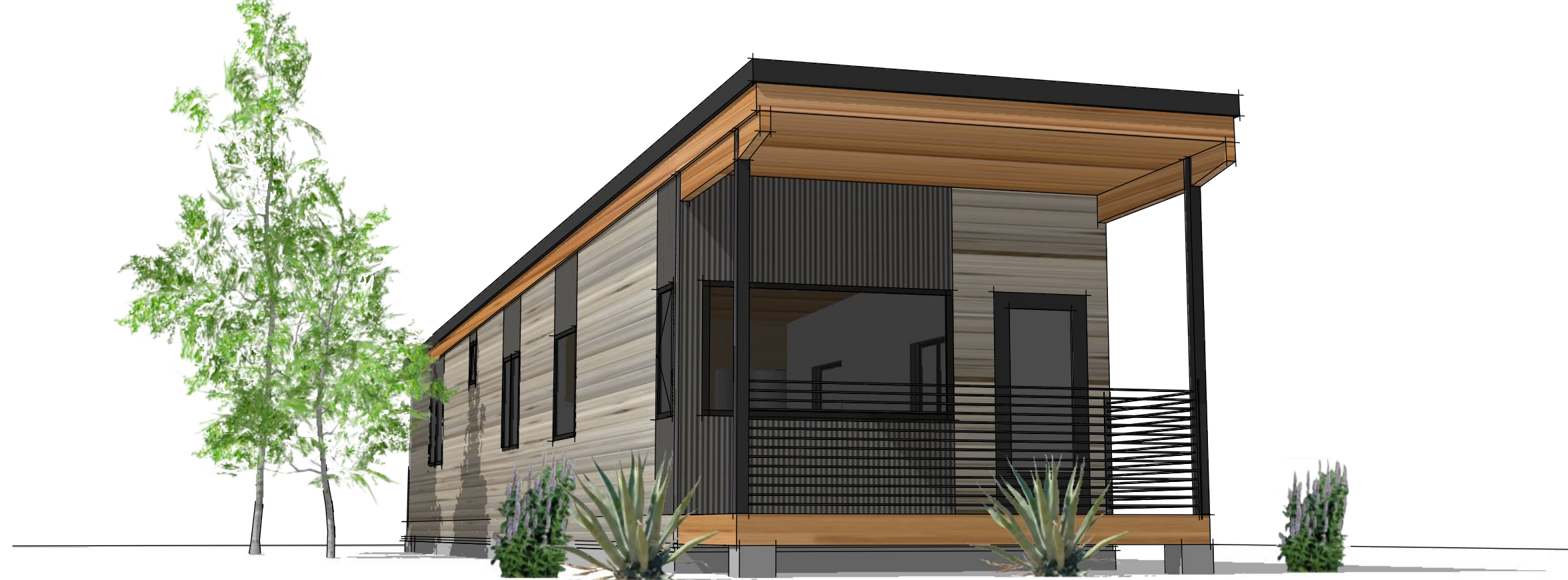
FRONT LEFT VIEW