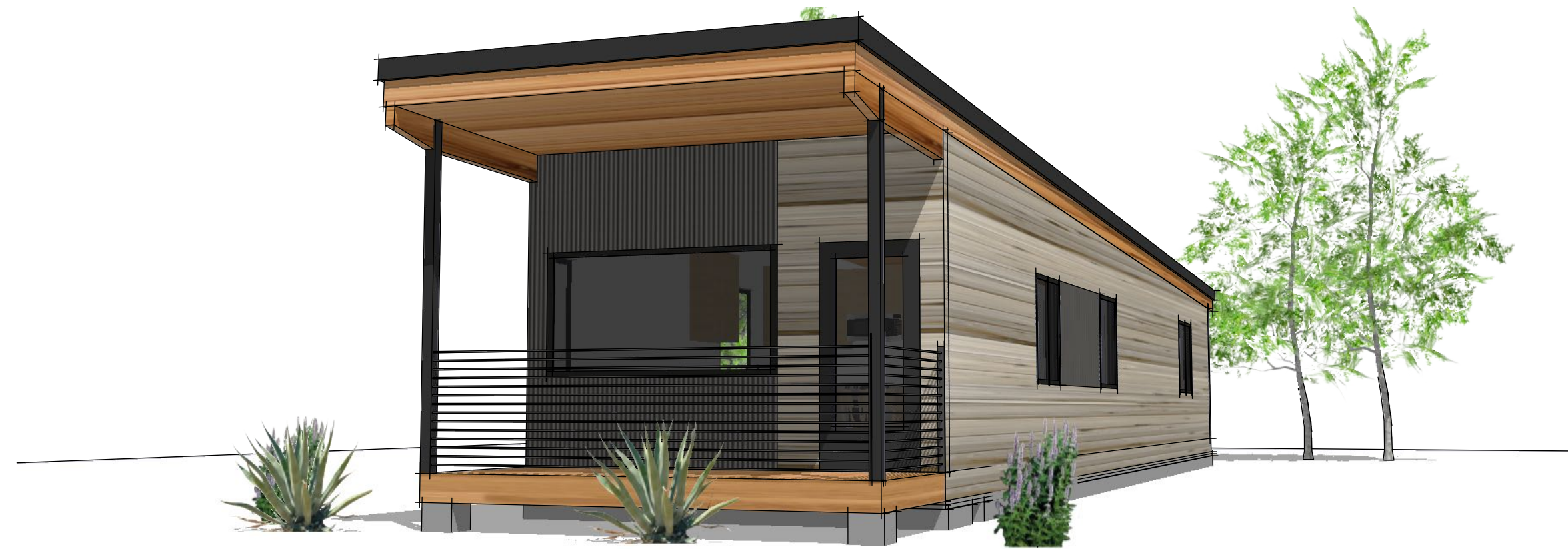
FRONT RIGHT VIEW